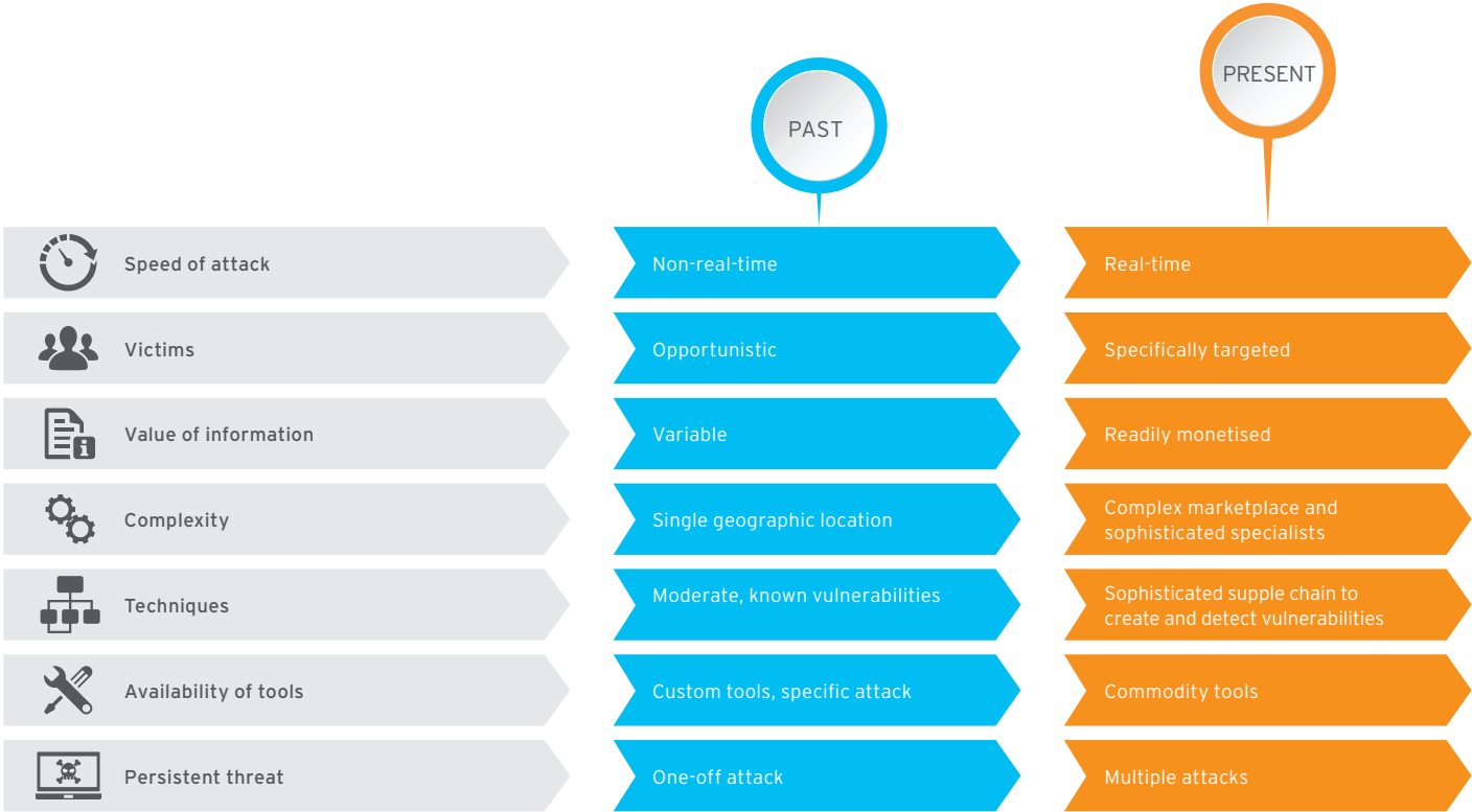
Diagram 2. Evolving Threats: An Illustration of the information Security Challenge