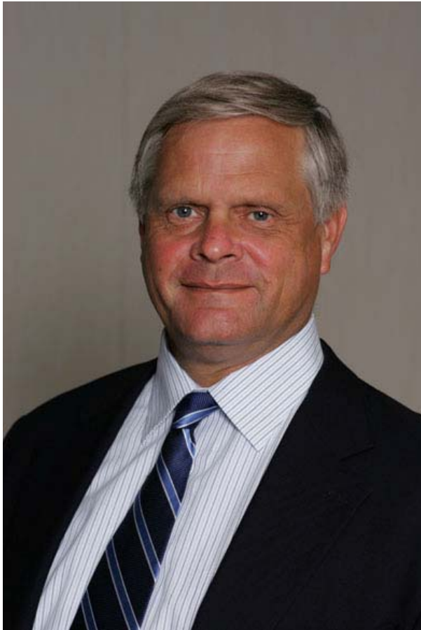
Citi Director Global Product Manager, Export and Agency Finance