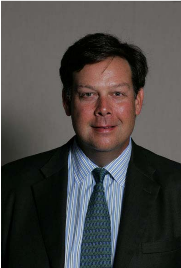
Citi Director Global Product Manager, Supplier Finance