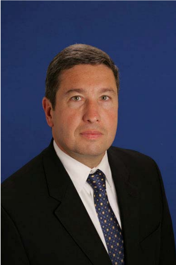
Citi Managing Director Global Product Manager, Receivables Portfolio Finance